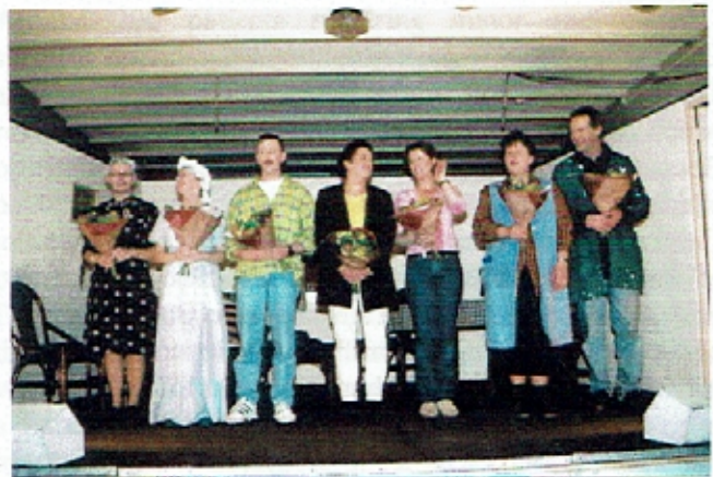
Flowers after performance "The Poltergeist"

(Editor; telephone Marco +31 (0)486-471257)